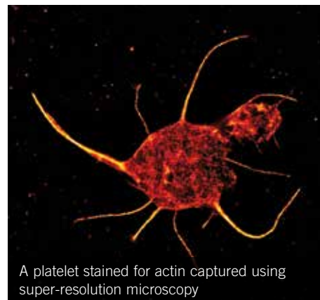
A platelet stained for actin captured using super-resolution microscopy